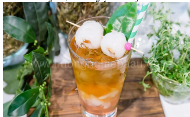
Figure 6 - Making lychee-tea juice

Then we can try to drink our delicious product as below figure showing: