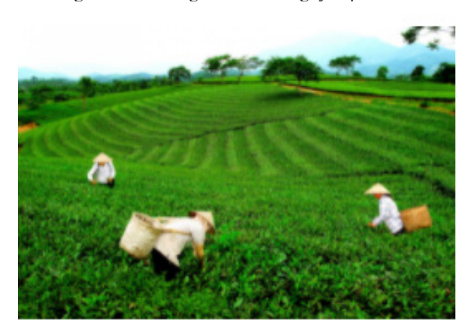
Figure 5 - Planting tea in Thai Nguyen province

From Thai Nguyen tea, we can process to make green or black tea and material to produce lipton tea.